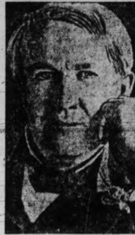
Thomas Alva Edison who celebrated his 70th birthday on Feb. 12, declared that he expects to live to be 100.